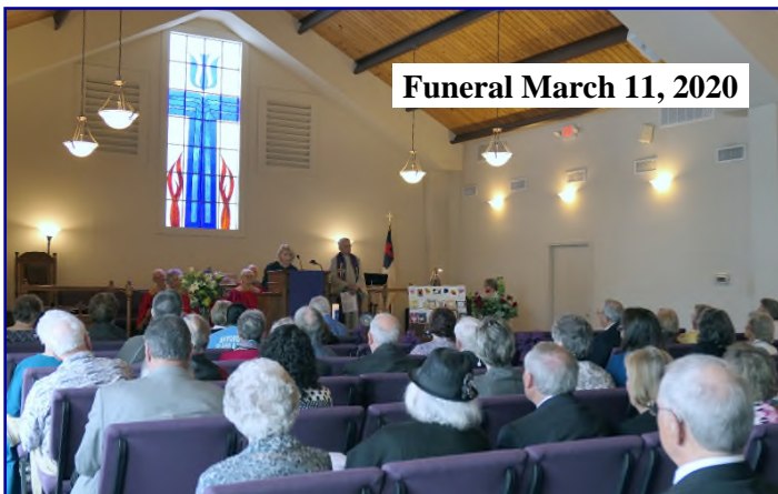
Funeral March 11, 2020